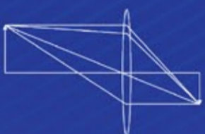
(A) Optical Lens

Image formation is achieved through array focusing (B) in an analogy to an optical lens (A):