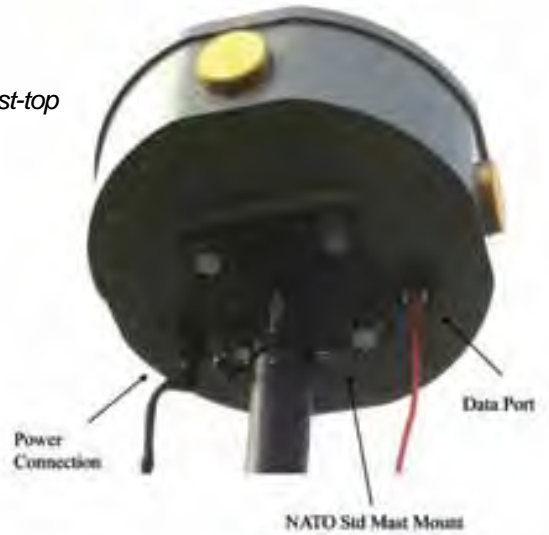
Phobos® integrated Sensor mounted on mast-top