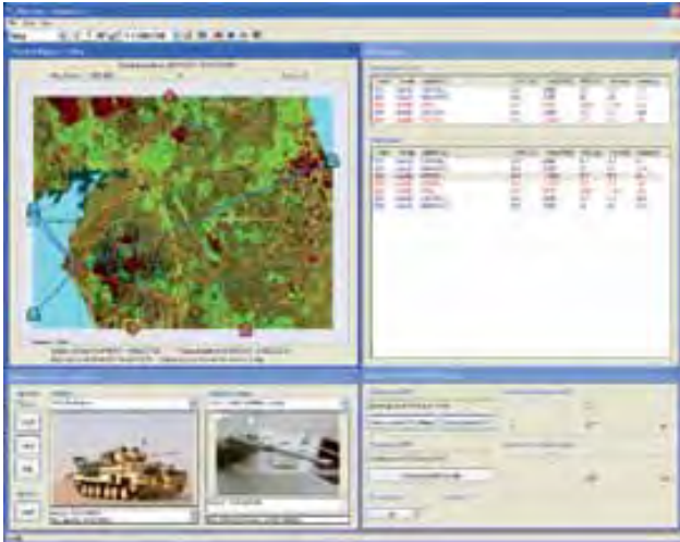
Colour MMI Display on rugged lap-top